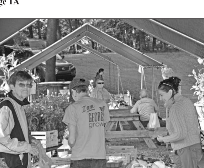
Folks are always welcome at the Towns County Farmers Market, open Saturdays from 9 a.m. to noon.

conclusion to their market season, which runs through September