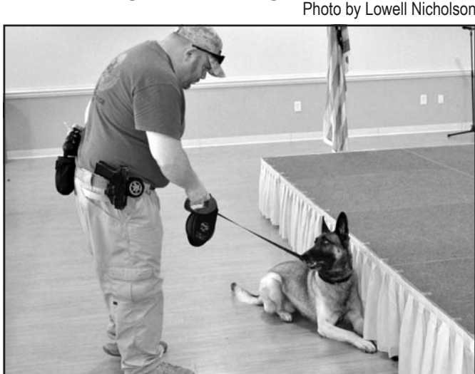
Looks like this EOD K-9 found what it was looking for at the Towns County Recreation and Conference Center.